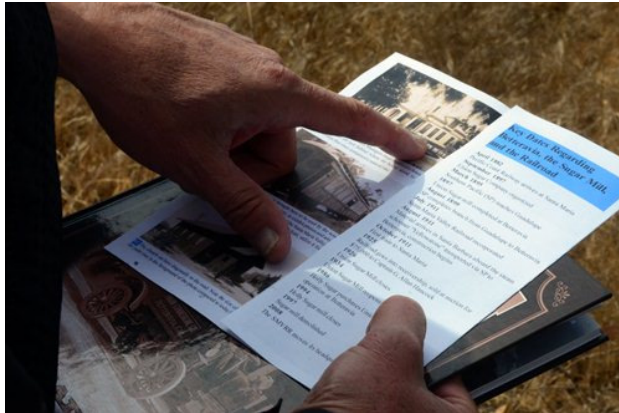
The Betteravia brochure pictured above is available as a download from Friends-SMVRR.org.