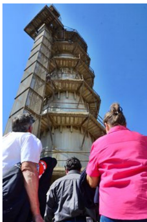
At the base of the lime kiln.