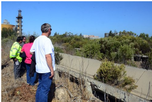
Above are the flumes which carried the beets in a river of water from the highline to the mill. Each highline track accommodated about ten sugar beet railcars.