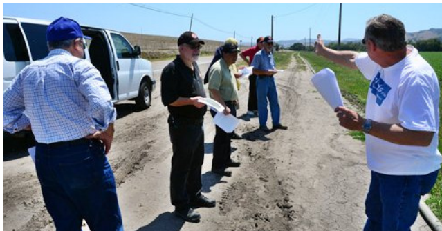
On the way to Los Alamos, the old right of way runs (mostly) along Highway 135.