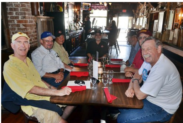
Lunch at the 1880 Union Hotel in Los Alamos. Continued on page 2...